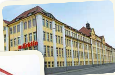
Open House Day in Göppingen