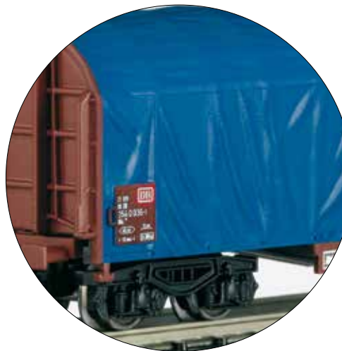
Prototypical down to the folds in the tarp