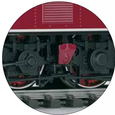
Prototypical modelling of the quill driving wheels