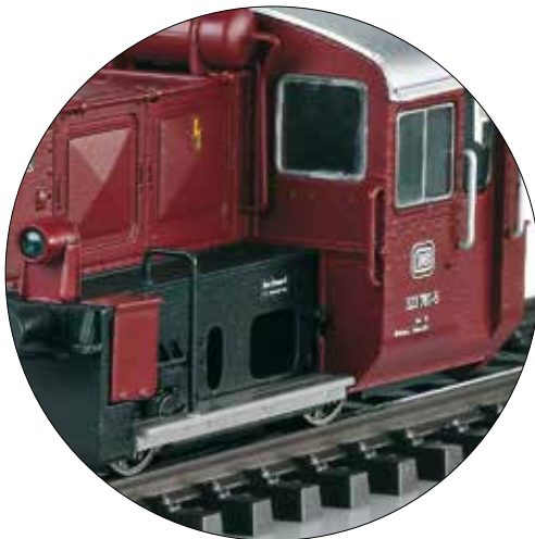
Separately applied metal grab irons