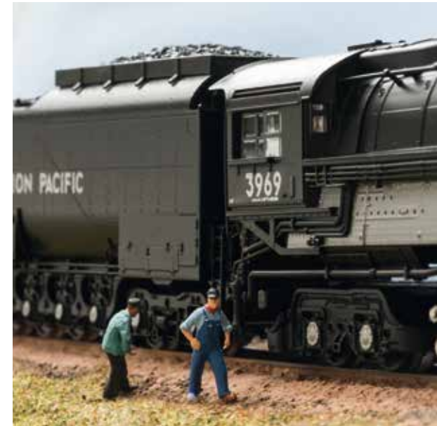
Impressively rich in detailing