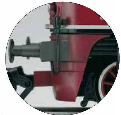
Lovingly modelled down to the details