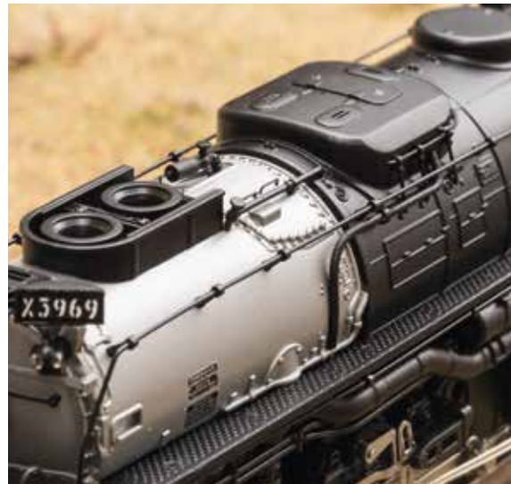
The "Challenger" of the Union Pacific impresses people with its gigantic optic and offers detailing in Trix quality from the pilot to the coal tender