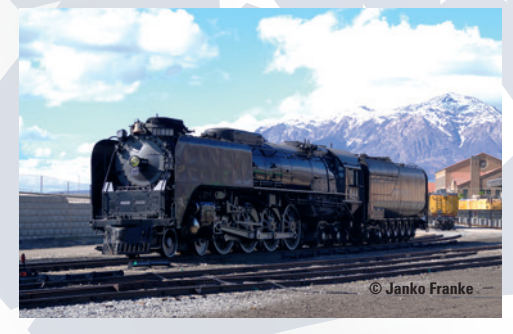
Prototype: Union Pacific Railroad (UP) class 800 heavy steam locomotive, with an oil tender. Locomotive road number 844. The locomotive looks as it did starting in 2016.

Model : The locomotive has a digital decoder and extensive sound functions. It also has various operating sounds such as oil and water being replenished or the opening and closing of sliding windows and ventilation hatches on the cab, all of which can be controlled digitally The locomotive has controlled high-efficiency propulsion with a flywheel, mounted in the boiler. 4 axles powered. Traction tires. The locomotive has Boxpok driving wheels. Maintenance-free warm white LEDs are used for the headlight on the locomotive and tender, cab lighting as well as number boards and marker lights, all of which can be controlled digitally. There is a factory-installed smoke generator with dynamic smoke exhaust. The