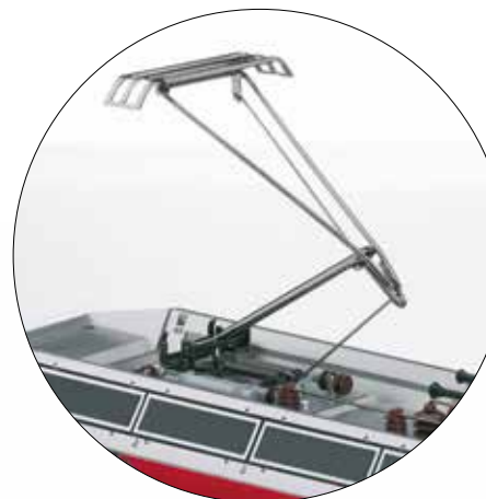
Pantographs can be raised and lowered by a motor

time on June 25, 1930 at 7:30 AM in Zermatt and finally reached the Engadine location of St. Moritz via Visp, Brig, Andermatt, Disentis/Mustér, and Chur after just eleven hours. The three Swiss railroad companies RhB, Furka-Oberalp Railroad (FO), and Visp-Zermatt Railroad (VZ) wanted to link up with this train to the tradition of popular luxury trains before World War I. This succeeded and the Glacier Express still crosses the 291 kilometer / 182 miles meter gauge line regularly in the cantons of Grisons, Uri, and Wallis.